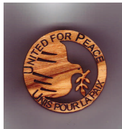
United for Peace Pin

The Mission and Outreach Committee of our Pastoral Charge invites you to participate in the United for Peace Campaign as one expression of our commitment to pursuing just peace with dignity for all God's people. The specific objective of this campaign is to raise two million dollars over two years that will be directed to peace initiatives around the world but focused especially on the conflict in the Holy Land.