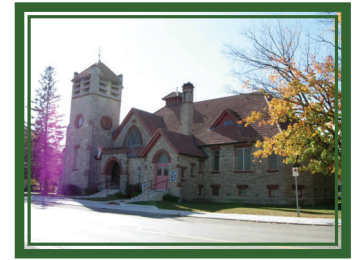
St. Andrew's United Church Services at 11 am