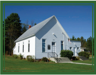
Zion United Church Services at 9:30 am